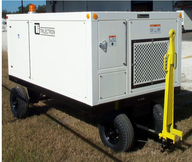
Model 5050 Trailer Mounted

TRILECTRON'S AIR-A-PLANE DIVISION 400,000 BTU/HR, Diesel engine driven heater